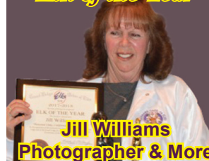
Jill Williams Photographer & More