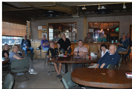
Super Bowl Party at the lodge