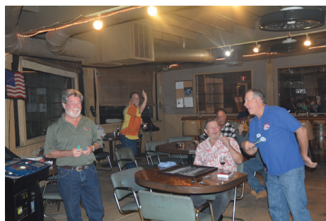
Dart Tournament and Potluck Dinner held every Tuesday night starting at 5:30pm

For more pictures of lodge events visit www.elks2477.com and click on the "Blog" link in the menu bar at the top of the home page.