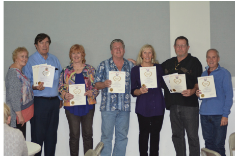
Purple Pig Dinner and fund raiser held on the 5 th Wednesday of January.