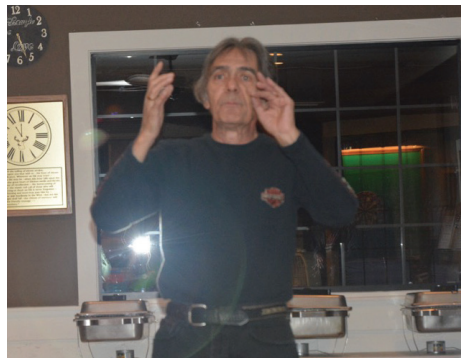
Special dinner for Tree Lot Volunteers