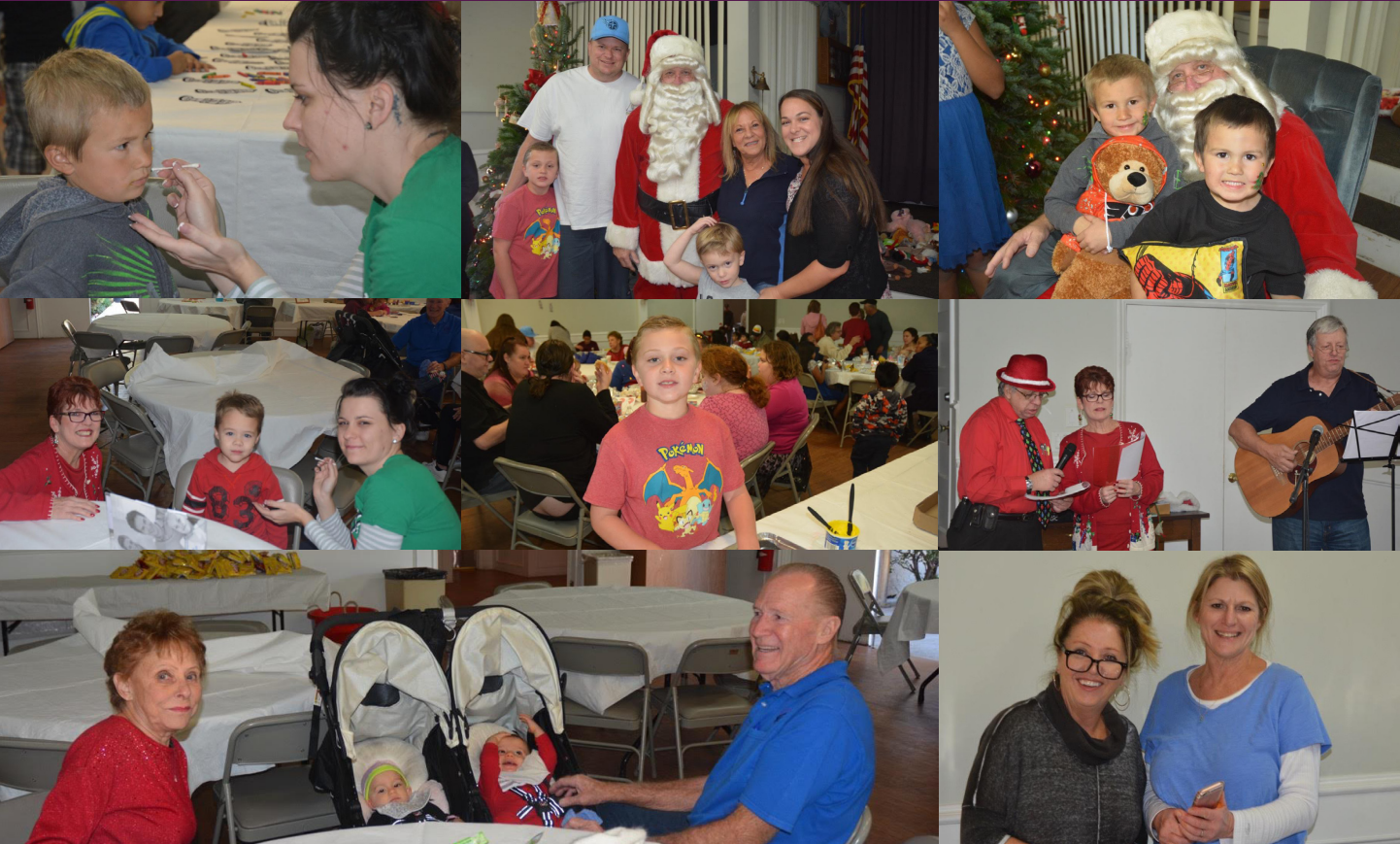
This year the Elks Ladies invited families of children in the First Five Day Care Program to join in their Children's Christmas Party.