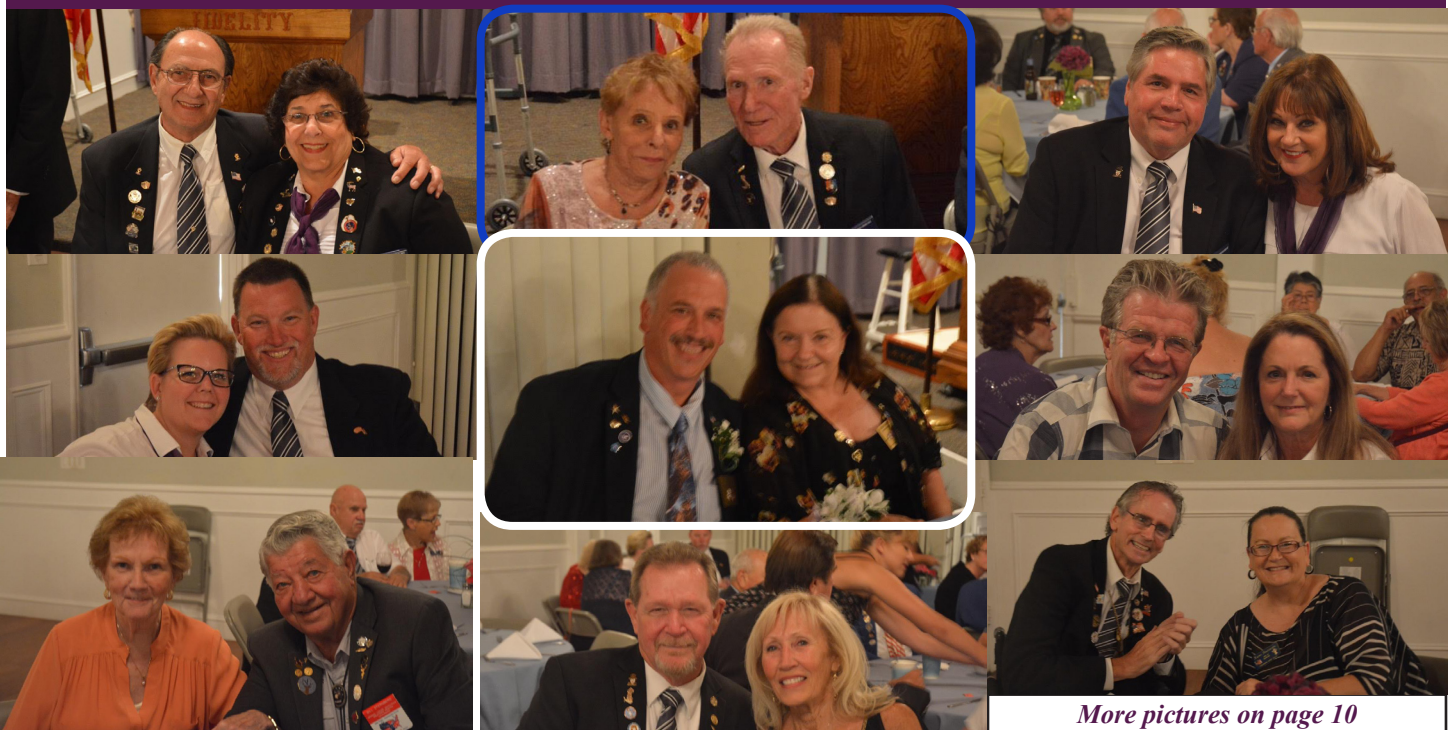
More pictures on page 10