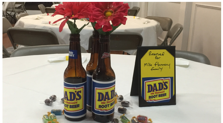
And of course, table centerpieces with Dad's Root Beer bottles.