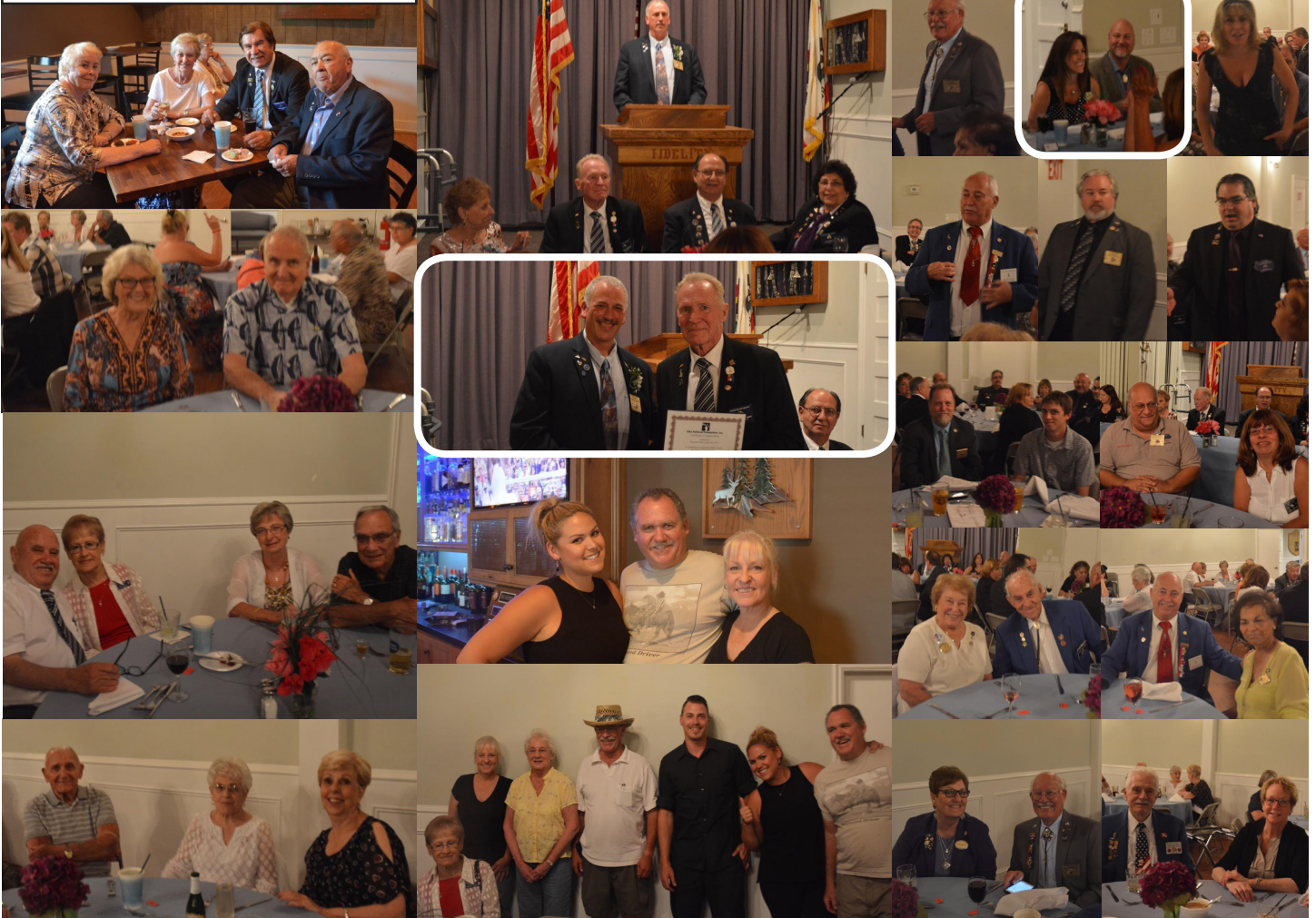
CHEA VP Visitation Pictures continued

Speaking of breakfast, (we were speaking of breakfast, right?), the El Konejo Kampers served 60 AA breakfasts and 41 Elks breakfasts on June 5 and on June 26 we served 73 AAs and 20 Elks breakfasts for a grand total of 194 breakfasts for June. Another fine effort. As a final note, although breakfast has been discontinued on most Sundays, the Kampers will continue to cook for the Elks on the first and last Sunday of each month as long as there is a demand. We don't require reservations, and we make the best eggs, omelets and pancakes to order in town. Call some friends and come on down.