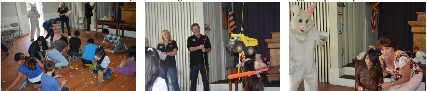
Middle Row - Children play the Pinata Game. Bottom Row - The children sort their eggs and candy.