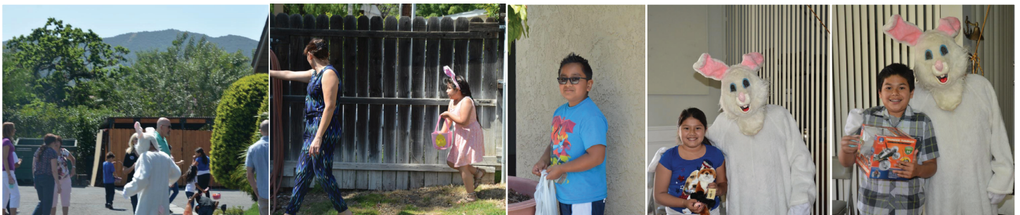
Above - The Easter Bunny visits the lodge as the children hunt for Easter Eggs and pose for pictures