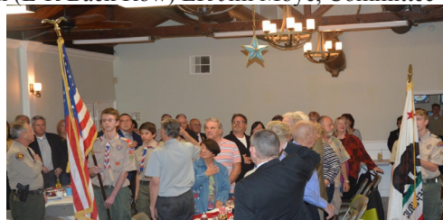
Presentation of Colors by Boy Scout Troops #754, #3763 and #3789