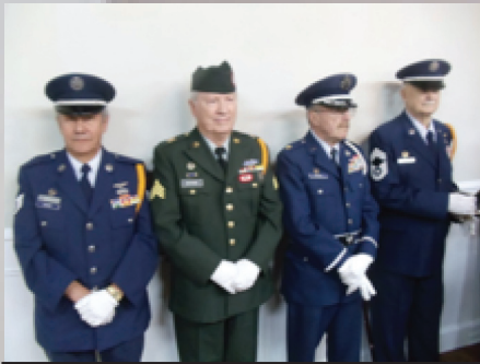
1 st Memorial Honor Detail

KARAOKE @ Cal Vet Home – Ventura – 4 th Thursday each month at 6:00 pm 10900 Telephone Rd., Ventura, CA