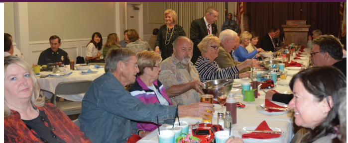
Members and guests gather to honor law enforcement officers and firefighters.