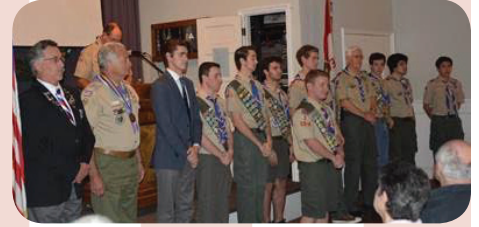
Eagle Scouts in attendance are presented to the audience