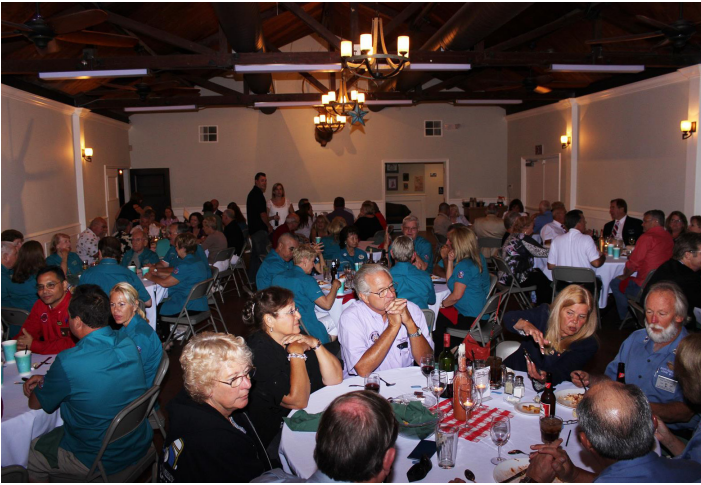
The Lodge Room is packed with visitors from throughout the WCCD and CHEA