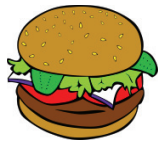
Corn on Cob