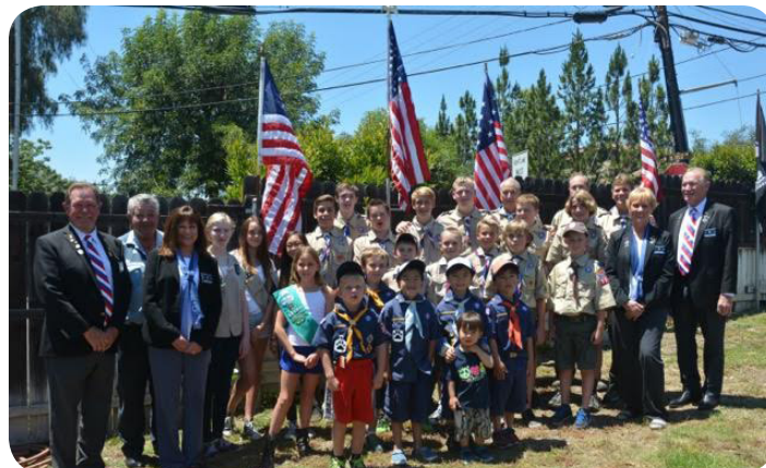
Our thanks go to the Boy Scouts, Girl Scouts, Cubs and Brownies as well as their families for making this ceremony a success