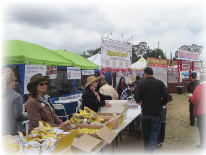
Volunteers serving lunch to the families