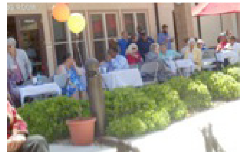
Volunteers enjoy food, entertainment, awards and door prizes.