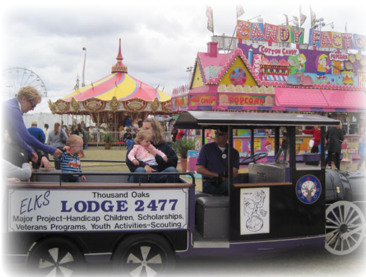
Families board the Elk Train