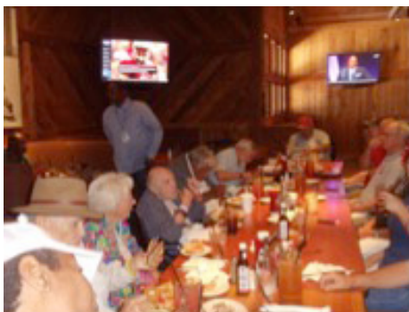
Lunch for veterans from Sepulveda V.A.

The Greater L.A. Veterans Administration put on a clinic at the Gold Coast Veterans Foundation at 4001 Mission Oaks Blvd, Camarillo for any veterans who need assistance. The event was attended by about 200 veterans. Lunch was provided for the staff by the Thousand Oaks Elks Lodge #2477.