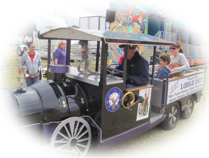
The Elk Train