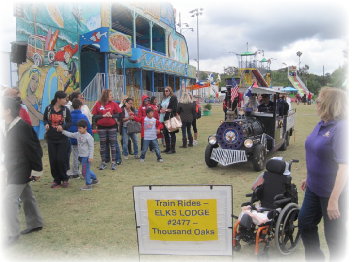
Families line up for the Elk Train