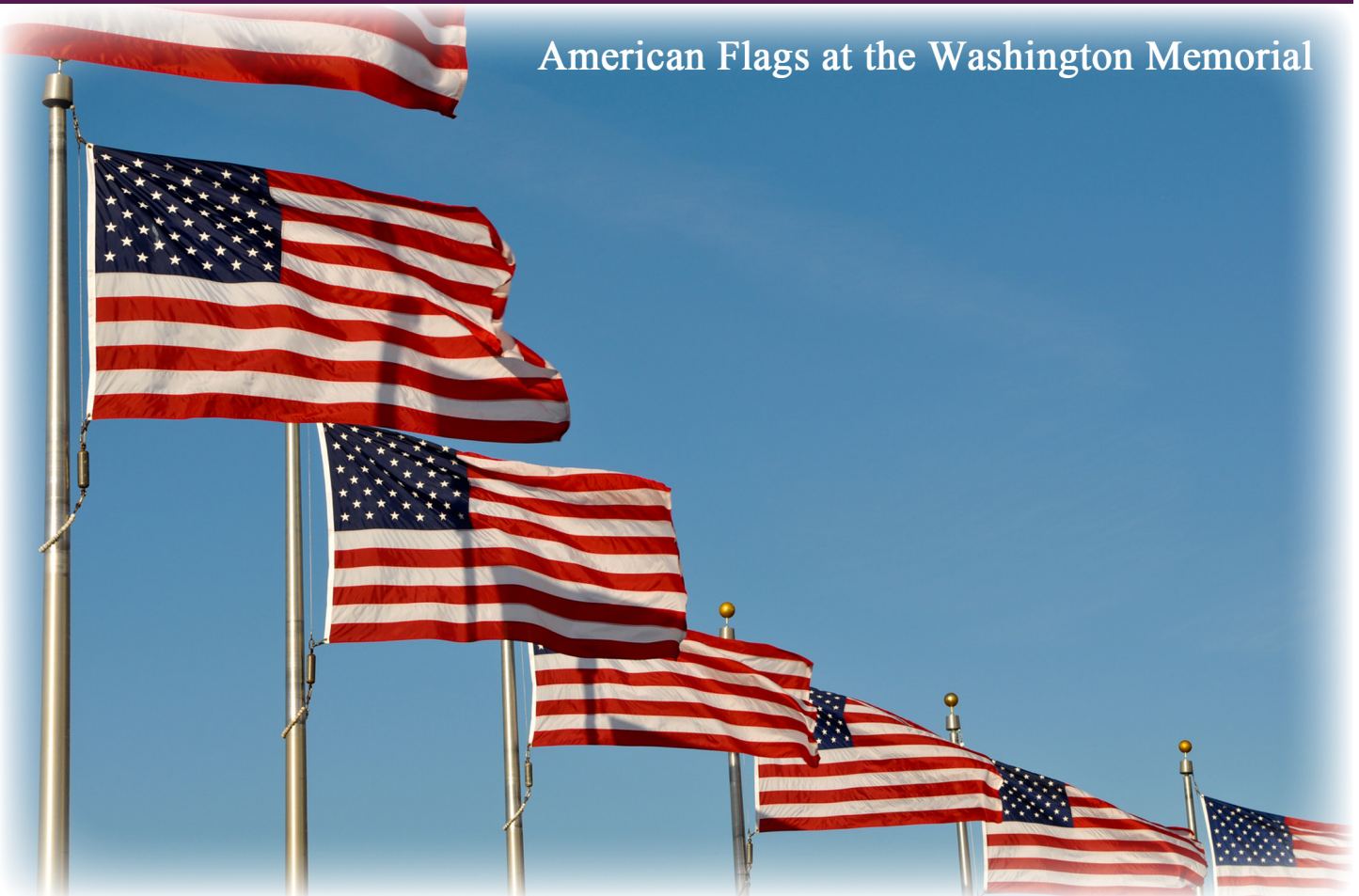
American Flags at the Washington Memorial