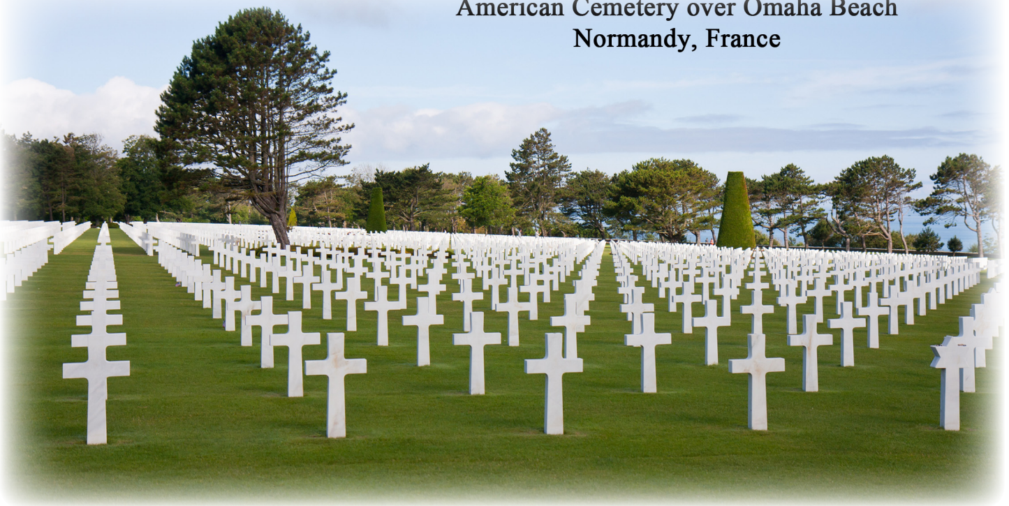
American Cemetery over Omaha Beach Normandy, France