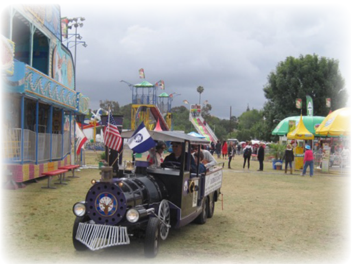
Passengers enjoy a ride around the park