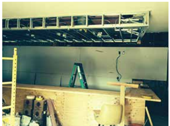
More Pics of Lounge Renovation