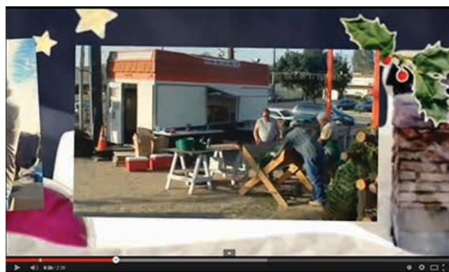
Watch the Christmas video at http://bit.ly/1wn5sit