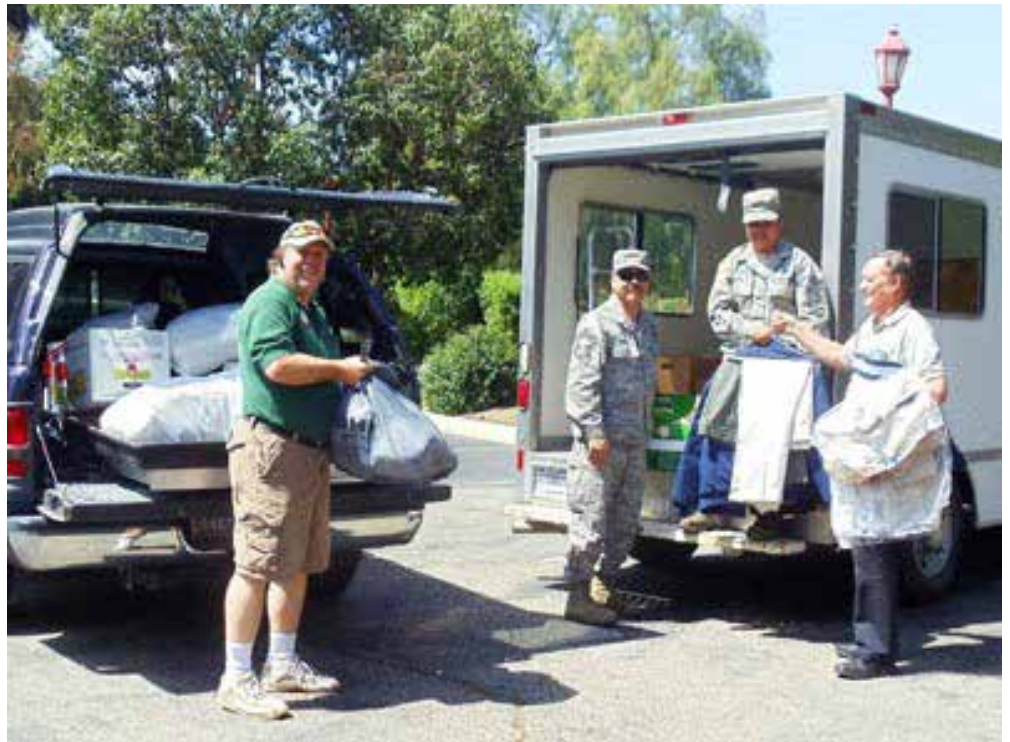
Past VC Standdown Participation

July 4, 1802 – West Point Academy Opens July 2, 1926 – U.S. Army Air Corps established July 4th – Independence Day July 1945 – World War II Allies hold the Potsdam Conference July 26, 1948 – President Truman issues Executive Order No. 9981 Desegregating the Military July 24, 1953 – Final U.S. ground combat of the Korean War began July 27, 1953 – Korean War ended; National Korean War Armistice Day