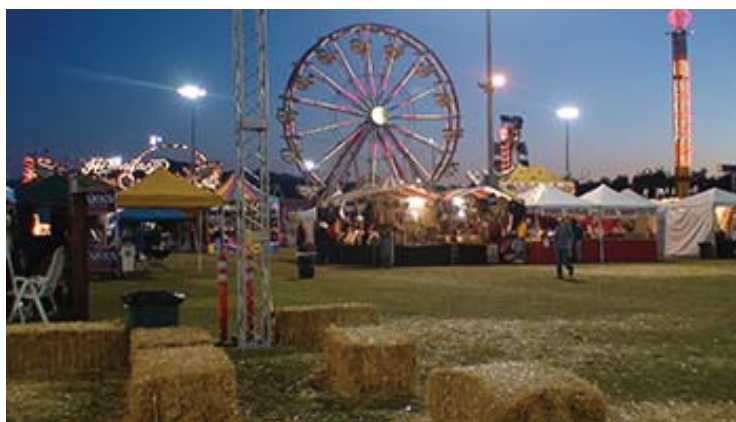
Conejo Valley Days Ahead!