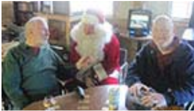
The Ladies helped bring Christmas to Young and Old alike