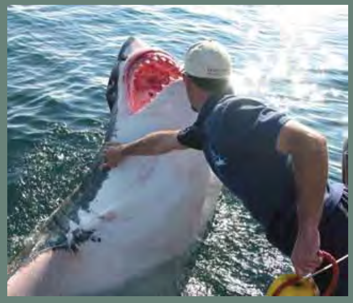
...a little further down, please.