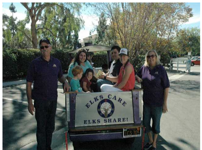
ELKS IN ACTION