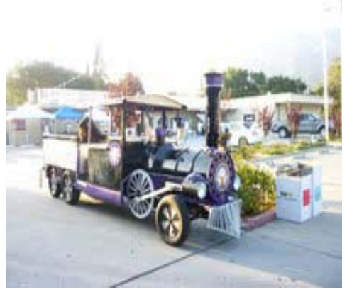
Our Lodge Train Piloted by Gerry Gillies Waiting for the Start of the Simi Valley Car Show