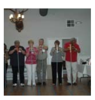
ERs are at the gate