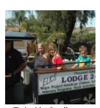
Train rides for all