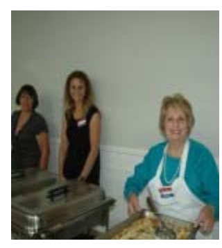
Elk Ladies serving