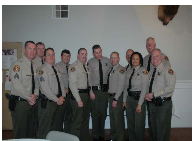
Police honoress at Appreciaation Night