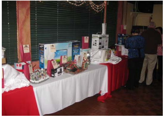
Only a part of the raffle tables

With that said - HAPPY NEW YEAR from all the Kampers and friends