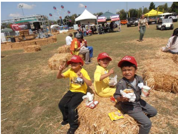
Kids enjoying the outing