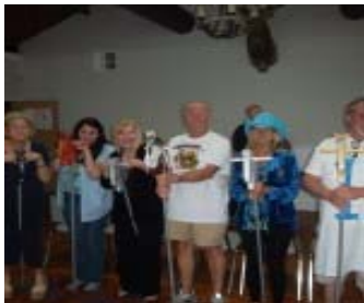
The horses at our races