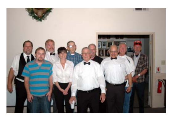
Kitchen crew and servers for the gala Installation Banquet