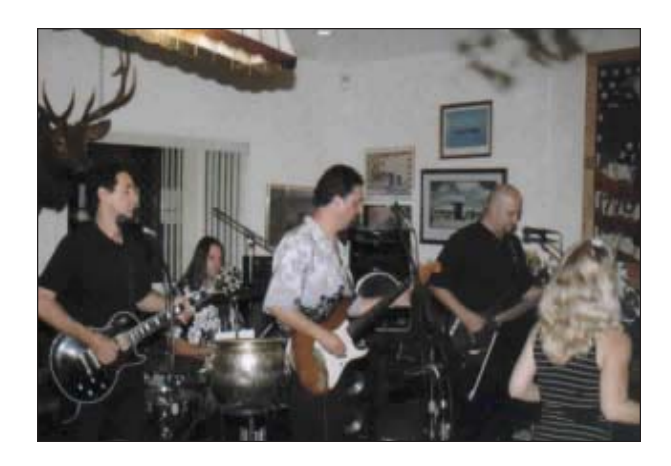
Friday night entertainment, Rockin' at the lounge with the Rider Band