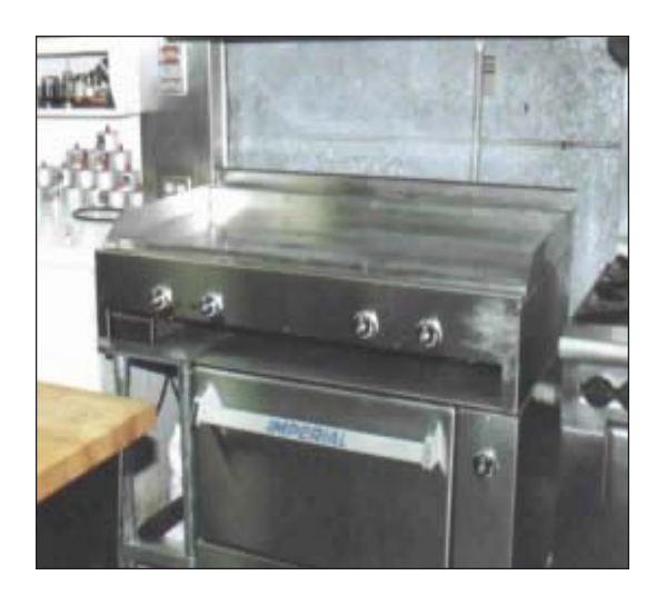
Home on the new range compliments of the El Konejo Kampers