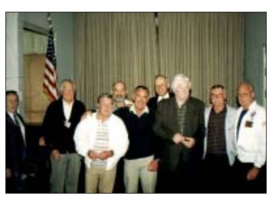
20 Year Members