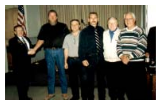
5 Year Members