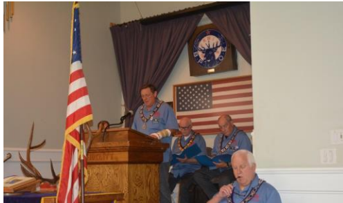
Father's Day Ceremony